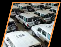
Handover & Commissioning

Worldwide support is available through the Jankel Approved Repairer network This network is continually evolving to establish schemes in close proximity to customer vehicles