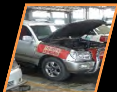
Service & Maintenance